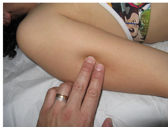
Figure 4 Fascial treatment of the radial nerve in the peripheral nervous system.

direct trauma that might damage the radial nerve. 27-29 The method of treating any emergence of the peripheral nerve is relatively simple and noninvasive. Once the fingers are in contact with the emergence and the most superficial area of the nerve branches, a fascial osteopathic technique is used,